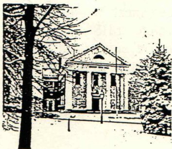
Sudbury Town Hall New Home of Sudbury Historical Society