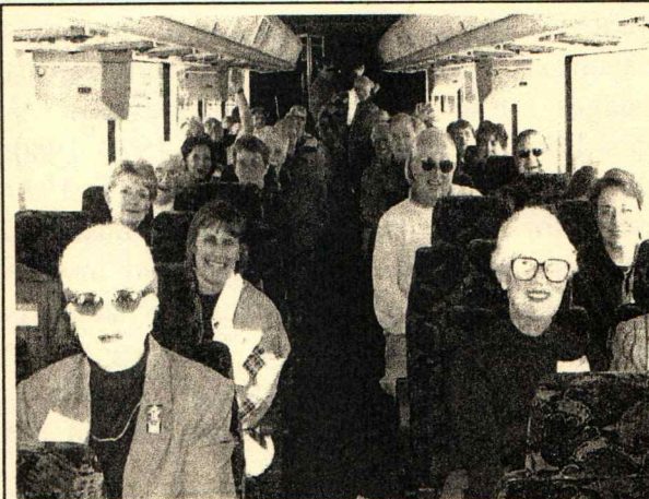
Members and guests are enjoying the May Bus Tour of Abandoned Sudbury, Part III.